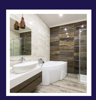
Plumbing & Sanitary Installation

Expert installation of ceramic, porcelain, marble, and stone tiles for both indoor and outdoor spaces.