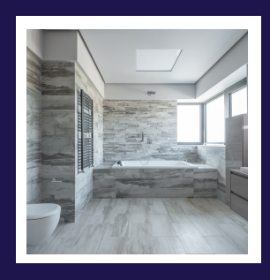
Floor & Wall Tiling Works

Expert installation of ceramic, porcelain, marble, and stone tiles for both indoor and outdoor spaces.